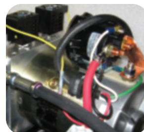
12V Electric Motor