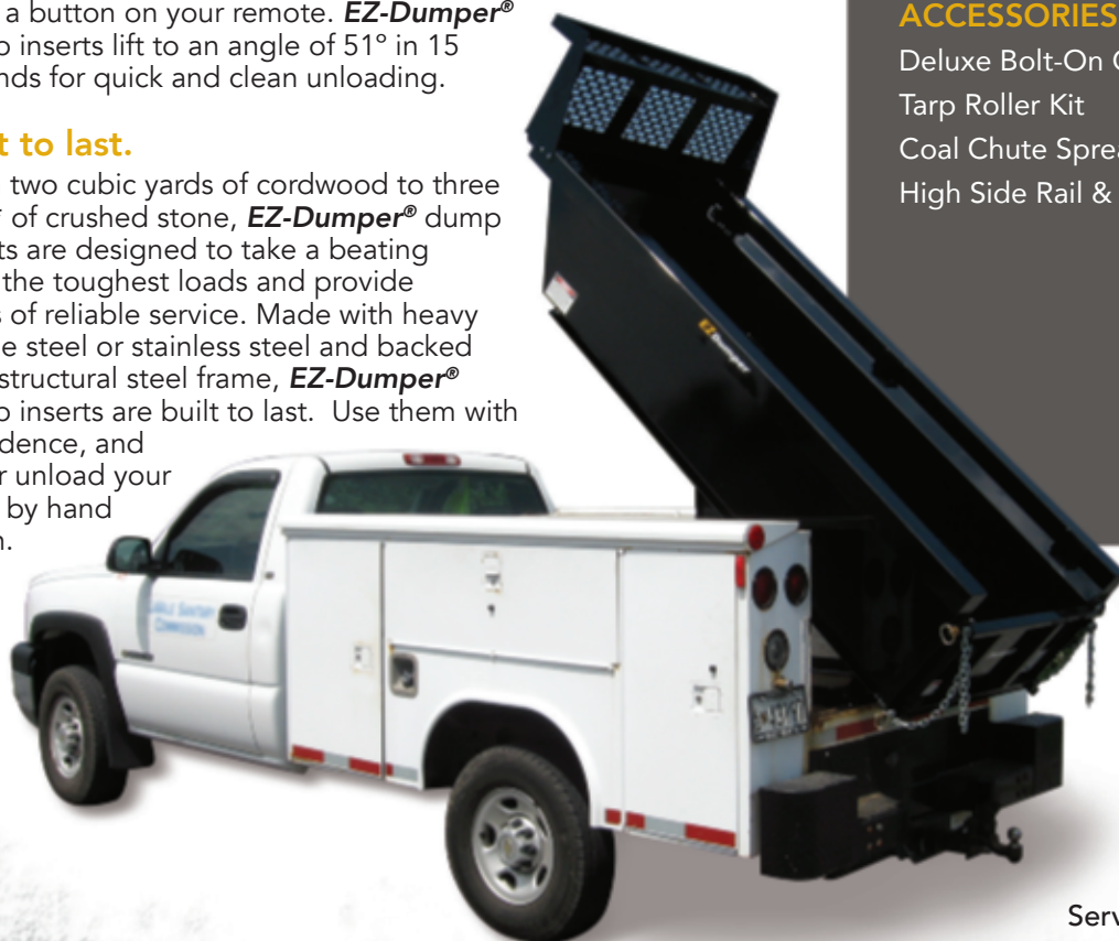
Service Body Dump Insert

From two cubic yards of cordwood to three tons* of crushed stone, EZ-Dumper® dump inserts are designed to take a beating from the toughest loads and provide years of reliable service. Made with heavy gauge steel or stainless steel and backed by a structural steel frame, EZ-Dumper® dump inserts are built to last. Use them with confidence, and never unload your truck by hand again.