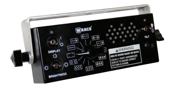
Control panel, 12 arrow patterns