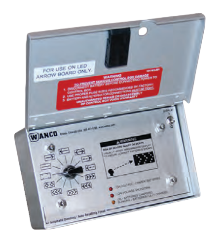
Control panel, 12 arrow patterns