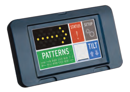
Touchscreen controller for wireless arrow boards