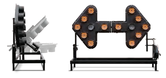
Low-profile power-tilt frame