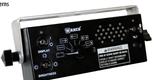
Control panel, 7 arrow patterns