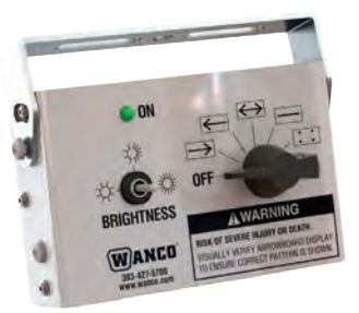
Control panel, 5 arrow patterns