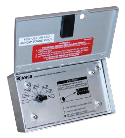
Control panel, 7 arrow patterns