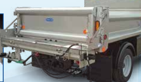
Stainless Steel Model