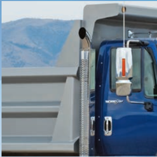
DuraClass HPT-316 features fully enclosed front corner posts.