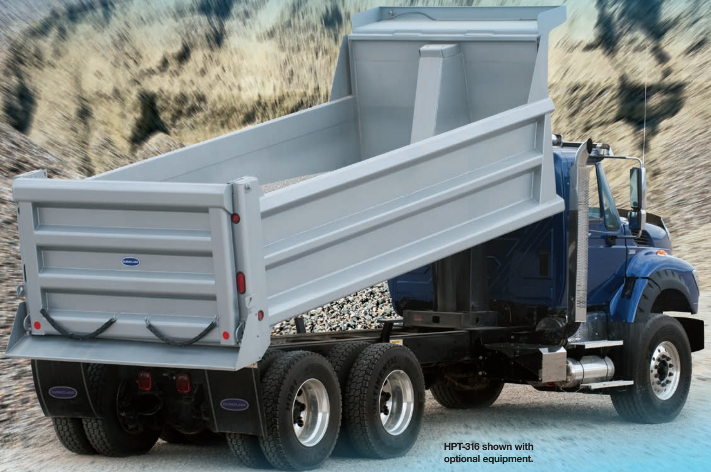
HPT-316 shown with optional equipment.