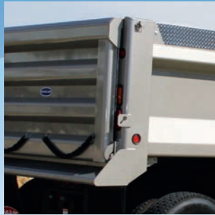
DuraClass bodies come with full depth corner posts and enclosed tailgate hardware.