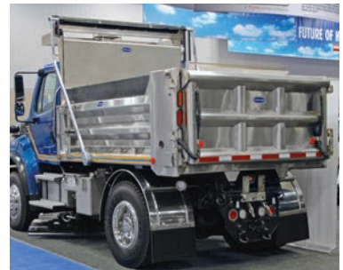
Premium Steel Construction- Minimum 45,000 psi. Additional steel and stainless steel options available.