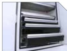
STEEL MECHANIC DRAWERS