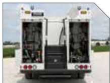
SPLIT REEL CABINETS