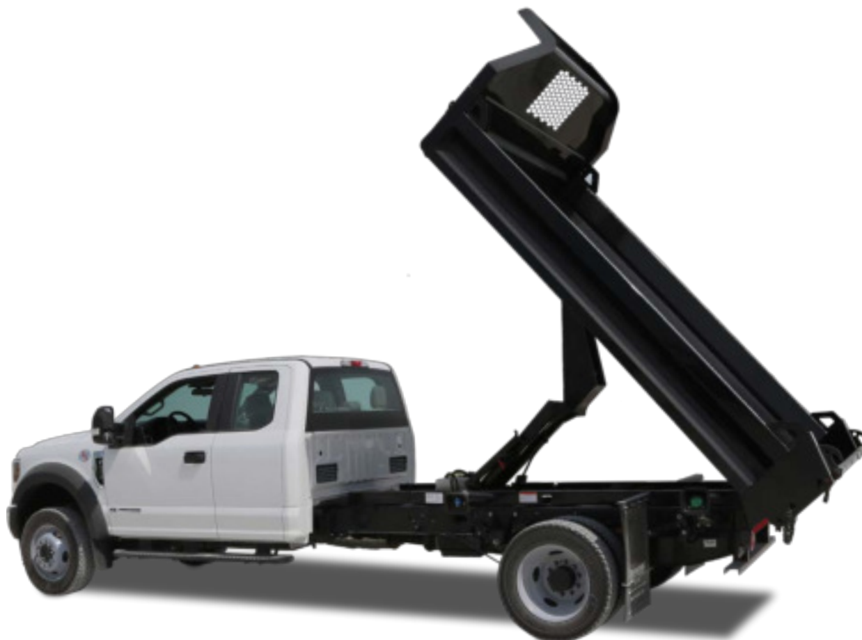
KDBF1112 *Body may be shown with optional features