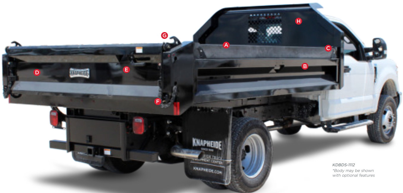
KDBDS-1112 *Body may be shown with optional features

Select from a variety of options to make your dump body a perfect fit.