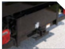
CLASS V RECEIVER HITCH