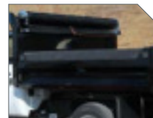
POLY BOARD EXTENSIONS