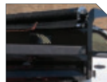
STRAIGHT FULL CAB PROTECTOR