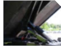
BODY RAISE INDICATOR