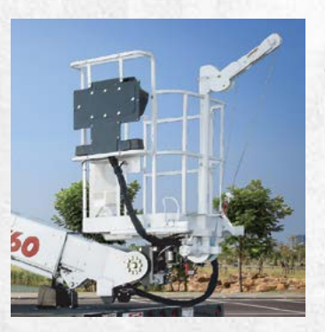
High Capacity Boom Winch

Provides touchscreen/ manual button operation, smooth and precise upper controls and Bluetooth connectivity to Elliott service.