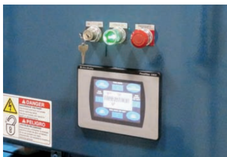
The touchscreen allows full automatic and manual control with one touch. Screens may be customized, password protected, and are designed with alarm, diagnostic and help screens.