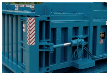
Marathon's Gemini Series balers feature a hydraulic door latch.