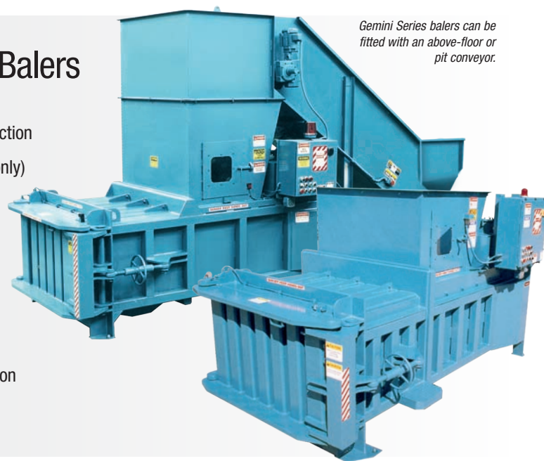
Gemini Series balers can be fitted with an above-floor or pit conveyor.