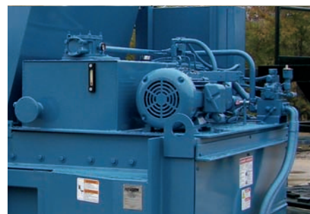
High-efficiency power unit with horsepower limited, pressure compensated piston pump.