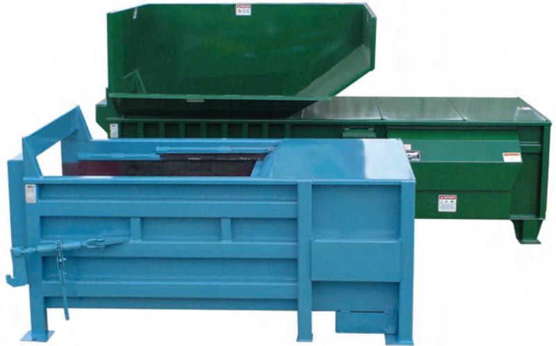
The TC-300T TANK (foreground) compared to a standard 3 cu. yd. compactor showing the difference in overall length — yet the clear-top opening of the TANK is the same as the larger RJ-325. The picture also illustrates that if the TANK is fitted with our standard 4-sided, rear feed hopper, there is no need for tread plates or guard rails in many applications.

The large clear-top opening accommodates large bulky items and delivers greater throughput capacity. The TC-300T TANK is ideal for dock feed applications. With our standard 4-sided, rear feed hopper, there is no need for special walk-on tops or guard rails in many applications.