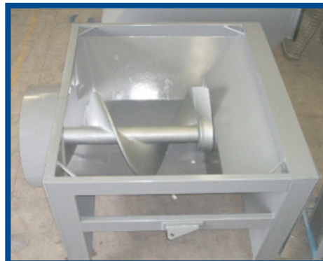
AST-220 Stationary Auger Compactor