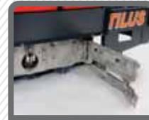
Heavy Duty Stainless Steel Components