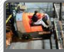
Read & React Maneuverability