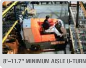
8'-11.7" MINIMUM AISLE U-TURN