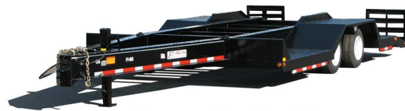
Shown with optional Ramps.