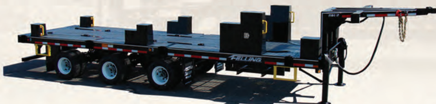
FT-50-3 LP GN (Low Profile) 39151