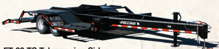
FT-20 TS Telescoping Sides 30862