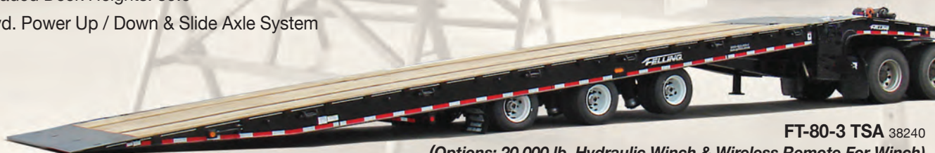
FT-80-3 TSA 38240

(Options: 20,000 lb. Hydraulic Winch & Wireless Remote For Winch)