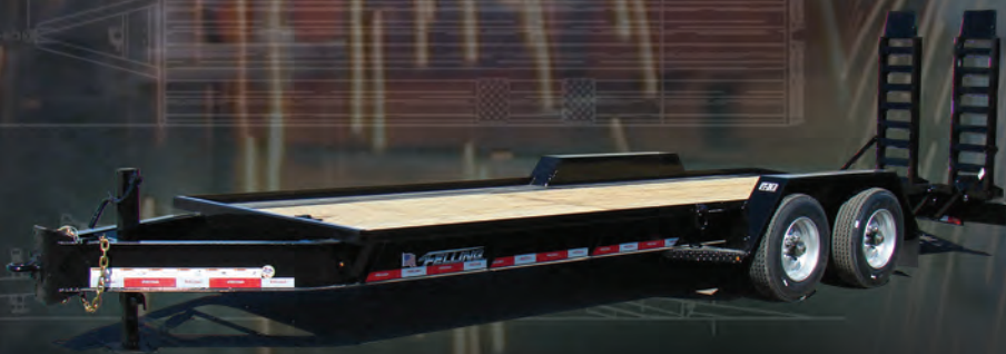
FT-24 I DRILL PKG. 84017-PKJ