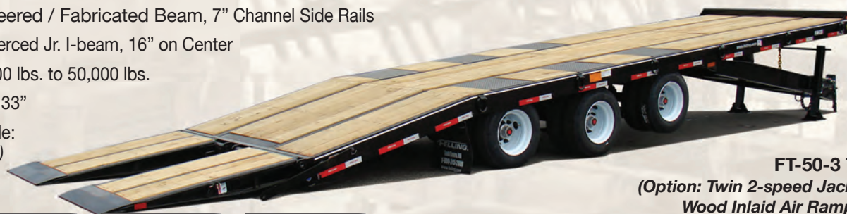
FT-50-3 TA (Option: Twin 2-speed Jacks, Wood Inlaid Air Ramps) 79384-JDM