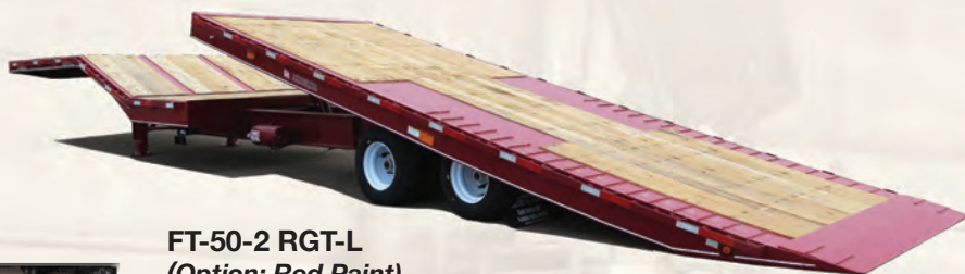
FT-50-2 RGT-L (Option: Red Paint) 50295-RAM