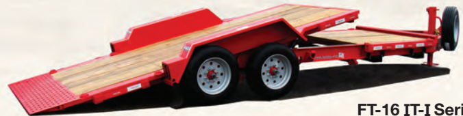
FT-16 IT-I Series (Option: Toolbox, Stationary Platform, Stake & Strap, Fork Pockets, Spare Wheel & Tire Mounted) 80543-LAE