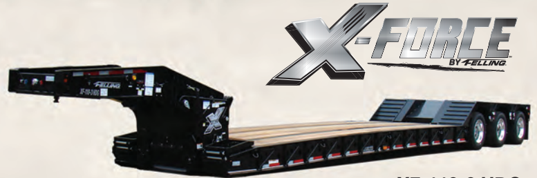
XF-110-3 HDG 41774-GKK