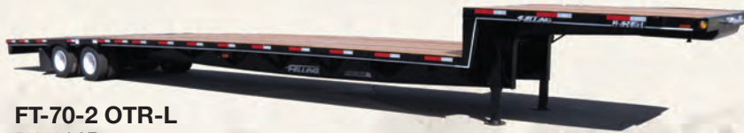
FT-70-2 OTR-L 56241-LAE