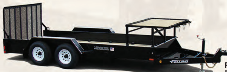
FT-10 CL 54887-LAE

Some models may be shown with optional equipment.