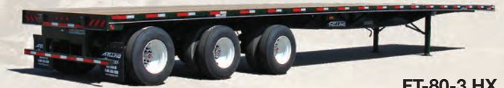
FT-80-3 HX 44053-NTU