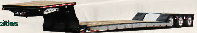
XF-AG-110-3 HDG 39469-NTU