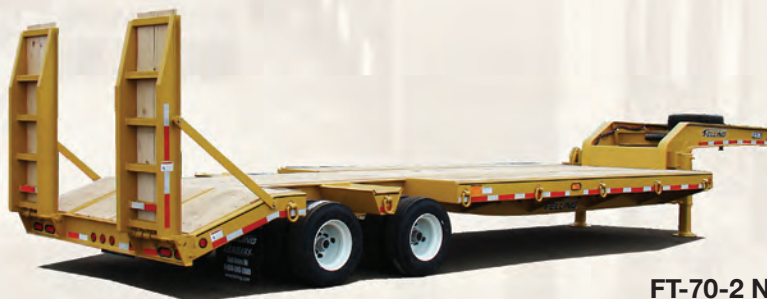
FT-70-2 NN-L (Options: Yellow Paint, Wood Inlaid Beavertail and Ramps) 32322-BOO