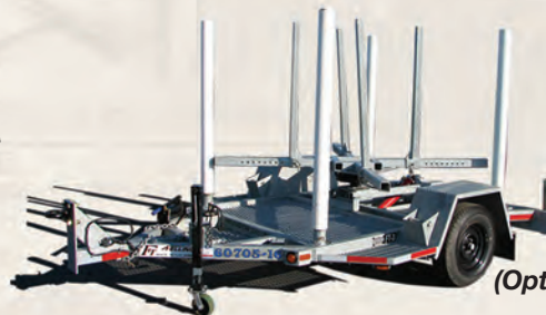
FT-3 C Coil (Option: Galvanized) 63329-NTU