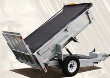
FT-6 DT (Option: Galvanized & Tarp System) 77686-EDS