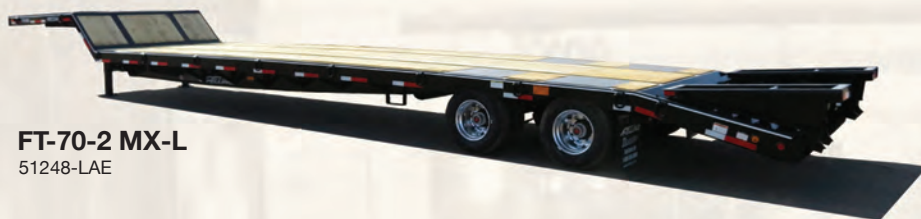
FT-70-2 MX-L 51248-LAE