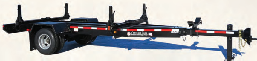
FT-12-1 PT 52154-LAE