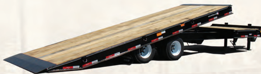
FT-30-2 T (Option: Stationary Platform) 78509-LAE