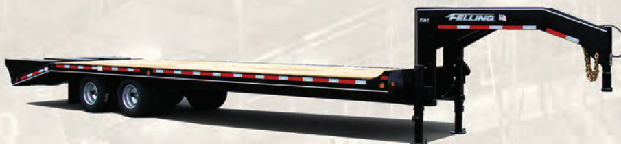
FT-24-2 GN (Option: Gooseneck) 37919