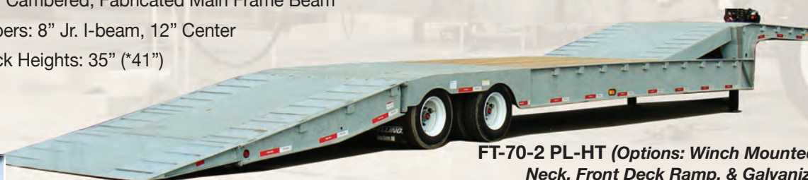
FT-70-2 PL-HT (Options: Winch Mounted in Neck, Front Deck Ramp, & Galvanized) 81712-LAE

Some models may be shown with optional equipment.