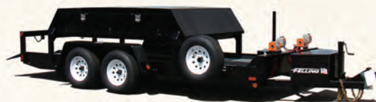
FT-10 T Scale Trailer (Pan Tilt) 35851