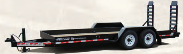
FT-12 P - Pan Series 79387-RTK