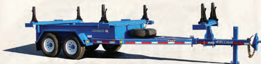
FT-14-2 PT-C 41775-BOO (Option: Cosmic Blue Paint, Front Bolster, Spare Wheel & Tire)