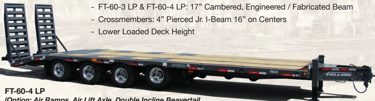
FT-60-4 LP (Option: Air Ramps, Air Lift Axle, Double Incline Beavertail, Hyd. Jacks, Aluminum Wheels & Paint) 74045-LAE