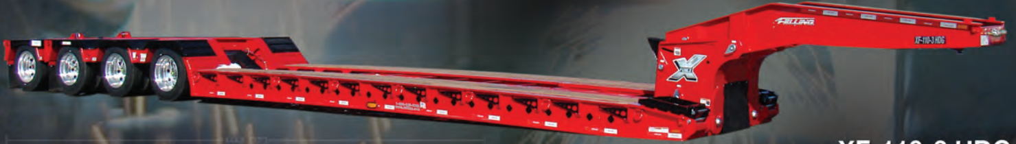
XF-110-3 HDG WITH XF-FLIP 20-1 72501-JDM

When It Comes To Your Equipment Hauling Needs - Talk To The Trailer Experts.