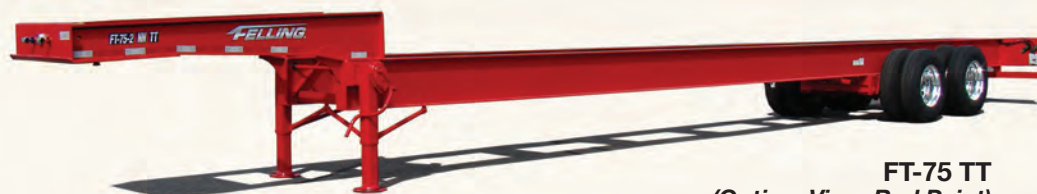
FT-75 TT (Option: Viper Red Paint) 38350