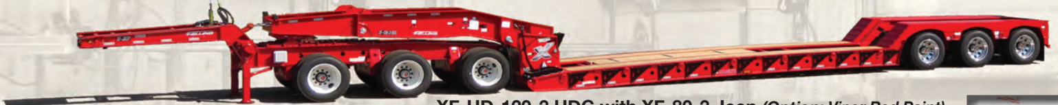
XF-HD-120-3 HDG with XF-80-3 Jeep (Option: Viper Red Paint) 39123-NTU

**HDG Accessories Available: XF-Flip 20-1, ST Single Spreader, ST Fixed Single Booster, XF-Jeep 60-1 & XF-Jeep 80-2