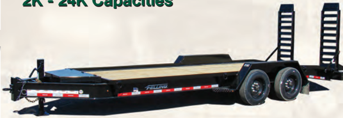
FT-16 I - I Series

(Option: Large Toolbox & Dovetail) 84018-PKJ