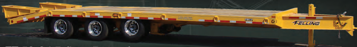
FT-50-3 LP (Low Profile) 53739-LAE