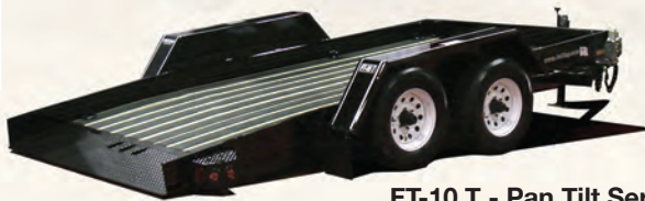
FT-10 T - Pan Tilt Series (Option: Blackwood Decking) 82785-EDS