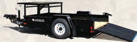
FT-6 CL 48532-LAE