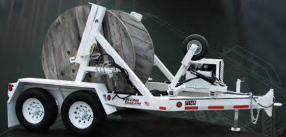
FT-14-2 R 34549