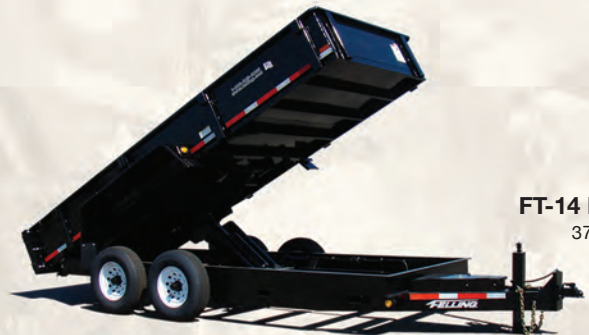
FT-14 DT HD 37668-LAE