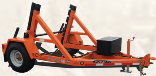
FT-8 R (Option: Omaha Orange Paint) 50570-EDS