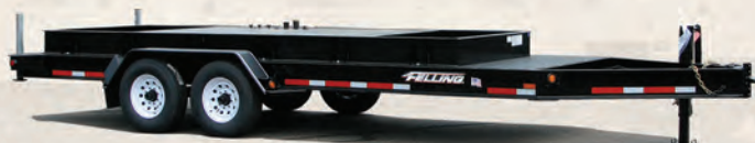
FT-14 GEN (Option: Fuel Tank) 33067