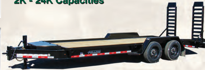
FT-16 I - I Series (Option: Large Toolbox & Dovetail) 84018-PKJ