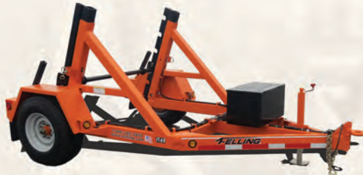
FT-8 R (Option: Omaha Orange Paint) 50570-EDS