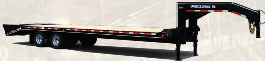
FT-24-2 GN (Option: Gooseneck) 37919