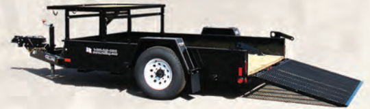
FT-6 CL 48532-LAE