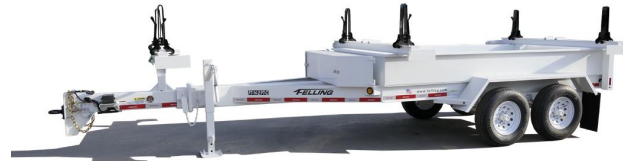
• Shown with optional toolbox & paint