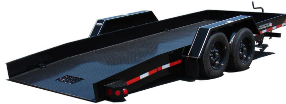
Shown with optional Floor Plate Decking