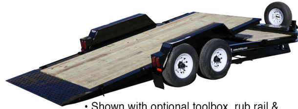
• Shown with optional toolbox, rub rail & stake pockets, spare wheel & tire mounted.