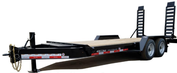
• Shown with optional large toolbox