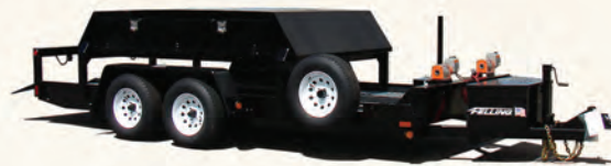
FT-10 T Scale Trailer (Pan Tilt) 35851 - Built to Customer's Specifications