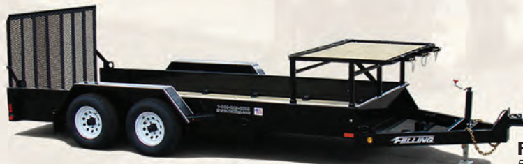
FT-10 CL 54887-LAE

Some models may be shown with optional equipment.