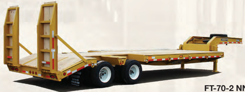
FT-70-2 NN-L (Options: Yellow Paint, Wood Inlaid Beavertail and Ramps) 32322-BOO