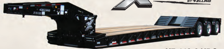
XF-110-3 HDG 41774-GKK