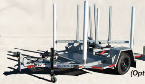
FT-3 C Coil (Option: Galvanized) 63329-NTU