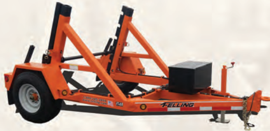
FT-8 R (Option: Omaha Orange Paint) 50570-EDS