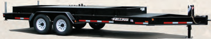
FT-14 GEN (Option: Fuel Tank) 33067