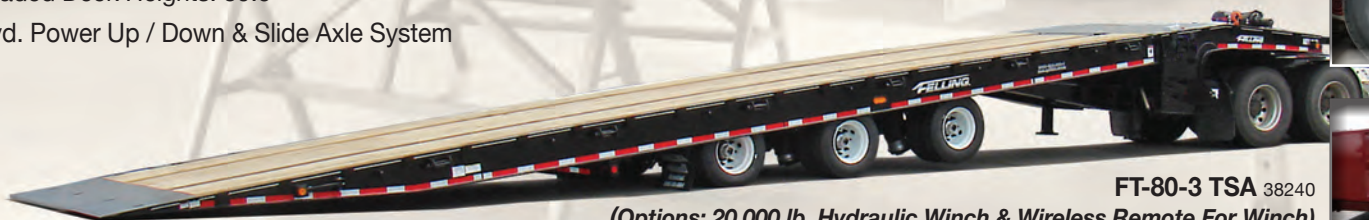
FT-80-3 TSA 38240

(Options: 20,000 lb. Hydraulic Winch & Wireless Remote For Winch)