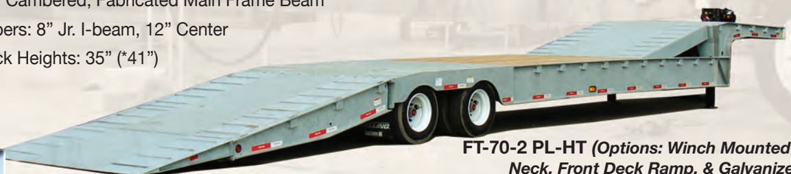
FT-70-2 PL-HT (Options: Winch Mounted in Neck, Front Deck Ramp, & Galvanized) 81712-LAE

Some models may be shown with optional equipment.