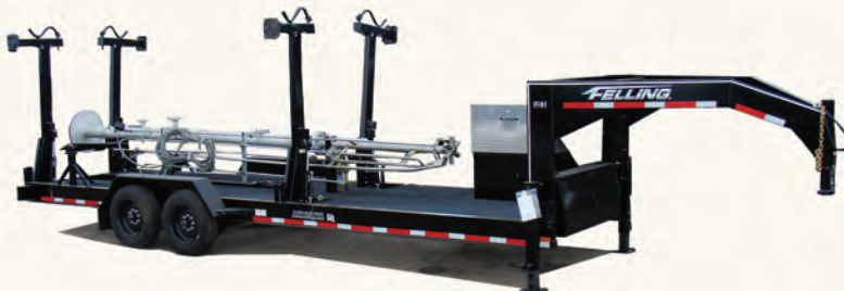
FT-16 I Gooseneck - Flare Trailer 47804-LAE - Built to Customer's Specifications

Some models may be shown with optional equipment.