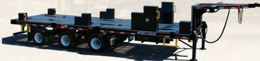
FT-50-3 LP GN (Low Profile) 39151 - Built to Customer's Specifications