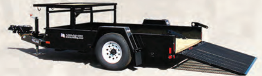
FT-6 CL 48532-LAE