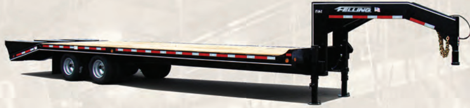
FT-24-2 GN (Option: Gooseneck) 37919