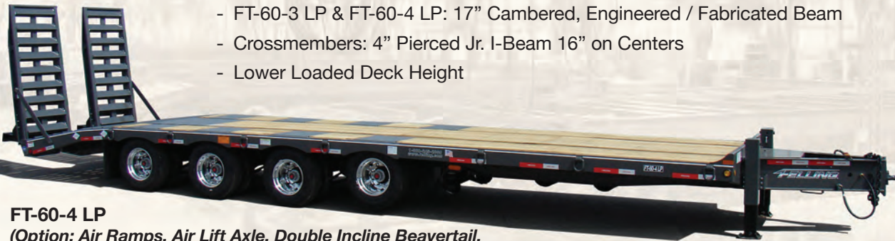
FT-60-4 LP (Option: Air Ramps, Air Lift Axle, Double Incline Beavertail, Hyd. Jacks, Aluminum Wheels & Paint) 74045-LAE