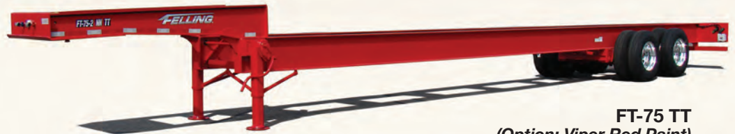
FT-75 TT (Option: Viper Red Paint) 38350