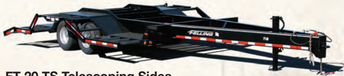
FT-20 TS Telescoping Sides 30862