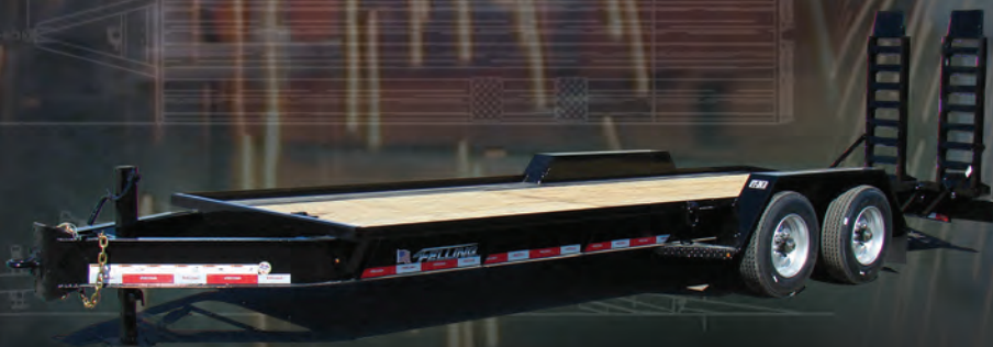
FT-24 I DRILL PKG. 84017-PKJ