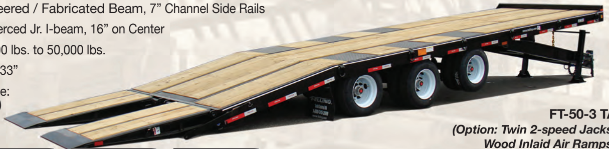
FT-50-3 TA (Option: Twin 2-speed Jacks, Wood Inlaid Air Ramps) 79384-JDM