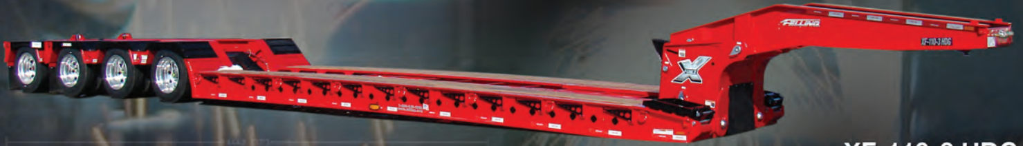
XF-110-3 HDG WITH XF-FLIP 20-1 72501-JDM

When It Comes To Your Equipment Hauling Needs - Talk To The Trailer Experts.