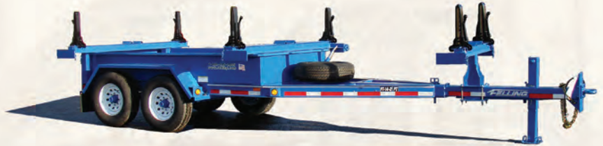
FT-14-2 PT-C 41775-B00 (Option: Cosmic Blue Paint, Front Bolster, Spare Wheel & Tire)