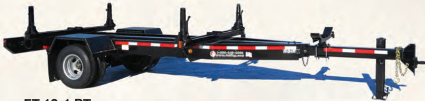
FT-12-1 PT 52154-LAE