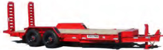
Shown with optional stake pockets, toolbox and paint