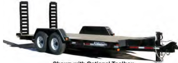
Shown with Optional Toolbox