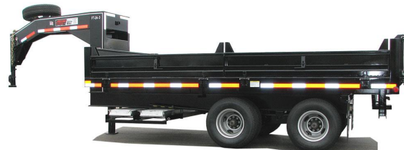
Shown with optional Aluminum Ramps with Storage, Gooseneck Hitch, Spare Wheel & Tire Mounted