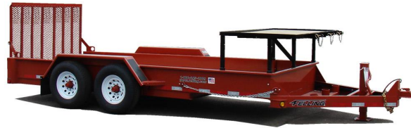
* Shown with optional paint