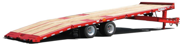
Shown in Optional Viper Red Paint