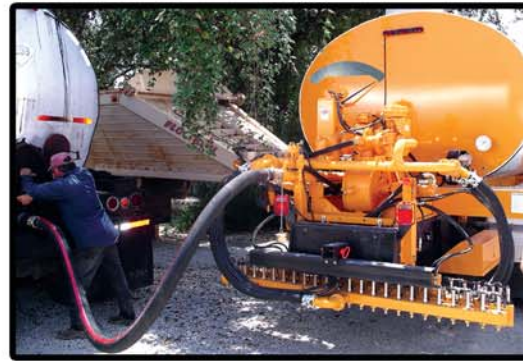
Load material using the Precision Spray 400 GPM asphalt pump. All pump functions pass through a single, self-cleaning strainer.

"I've owned all the different makes of asphalt distributors... when it comes to coverage, rate application control and material management, none are better than the Mauldin Precision Spray. These items along with the fully automated clean out system make these the most complete trucks I've owned." – Frank Folino, A. Folino Construction Inc., Oakmont PA