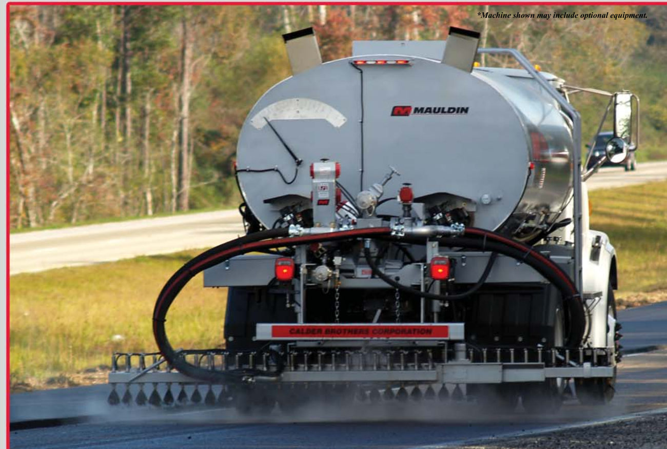
*Machine shown may include optional equipment.