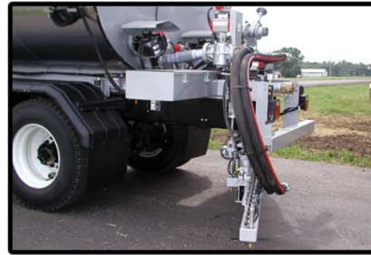
Precision Spray's exclusive center break-away system allows the bar to move if hit by an object.