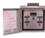
Patented VIP - Low Voltage Shutdown