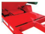
Platform For Safe, Easy Hopper Access