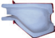
Patented Heat Management System