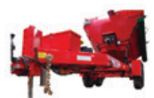
Lifetime Frame Warranty

Falcon Asphalt Repair Equipment 2600 W. Salzburg Rd Freeland, MI 48623 sales@falconrme.com