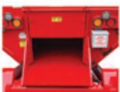
Large Unloading Door For Easy Access