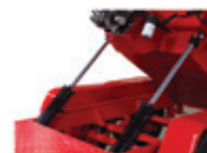
Dump System - Pivot Point & V-Body