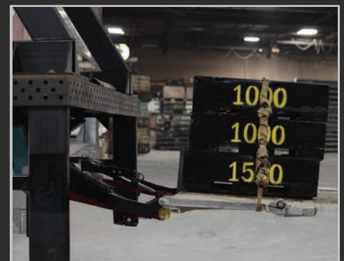
DCT-33 Endurance Test

That's just one example of how an Anthony liftgate is built to outlast the rest.