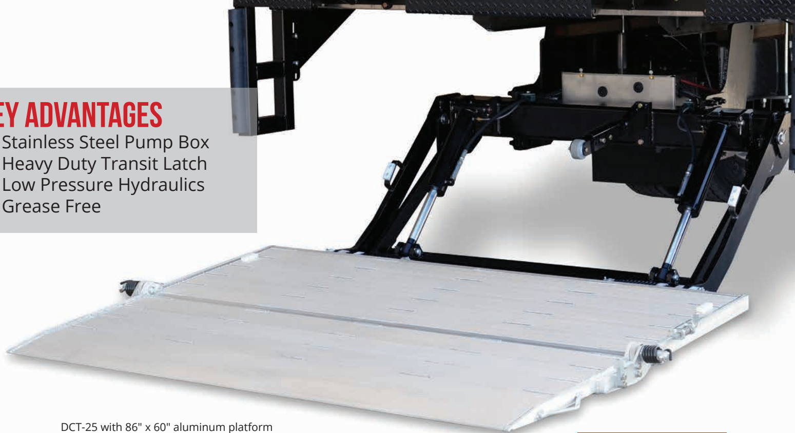
DCT-25 with 86" x 60" aluminum platform