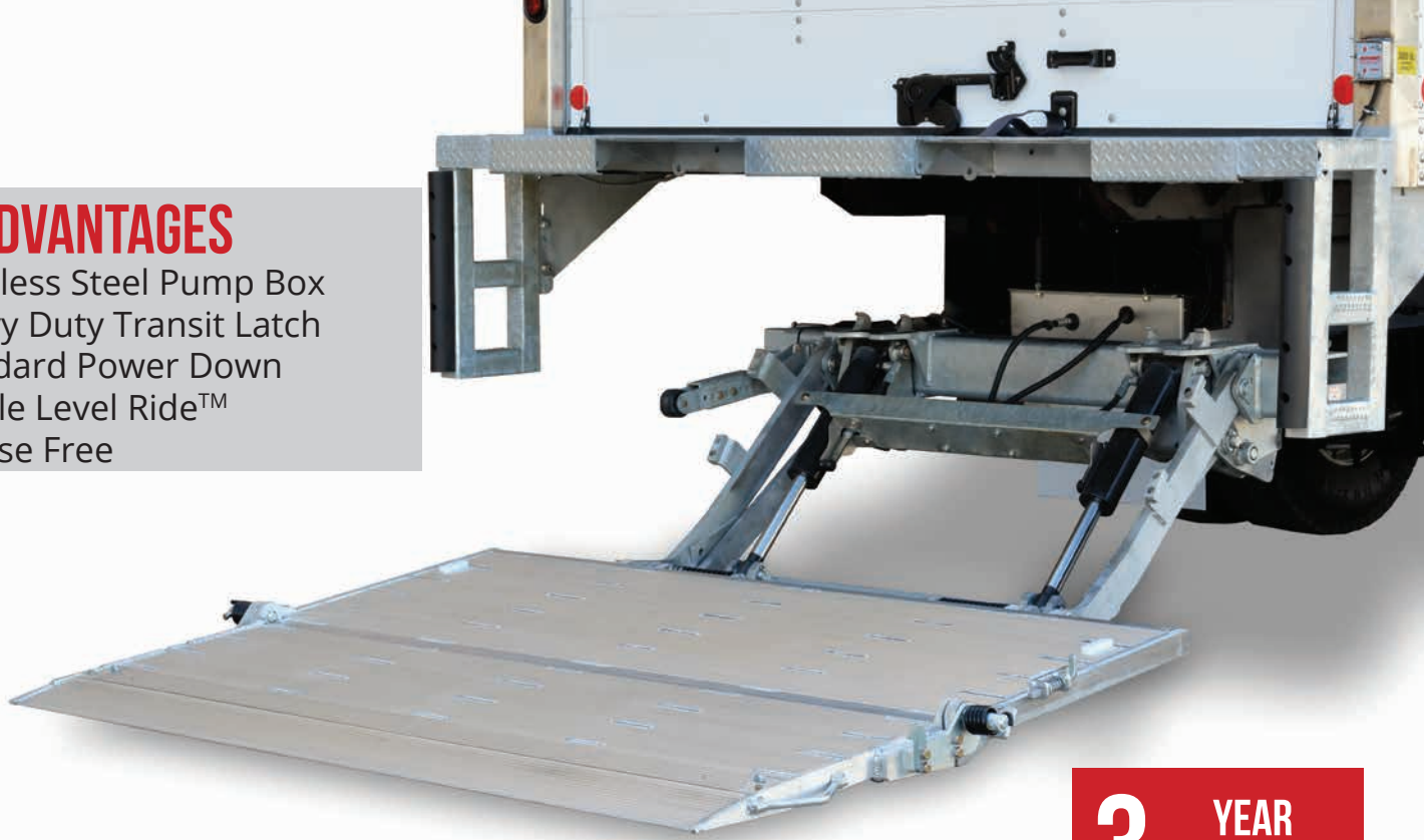
MTU-GLR-3-A with optional galvanized finish