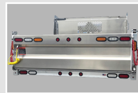
Rear Light Bar (Compatible with Under Tailgate Sand Spreader)

Visit our website at DuraMagBodies.com for additional options »