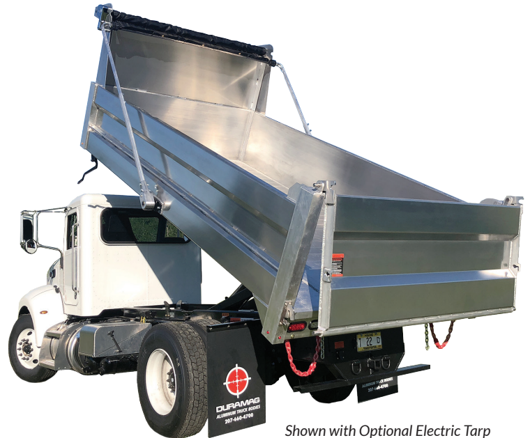
Shown with Optional Electric Tarp