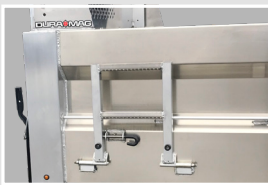
Fold-Up 2 Step Ladder