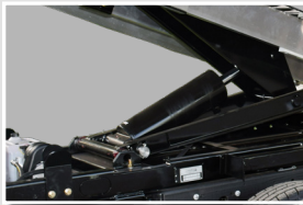
Champion Hoists Manufactured in USA