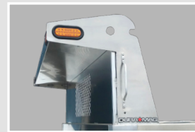
Strobes (Shown on Standard Cab Shield with Optional Grab Handle)