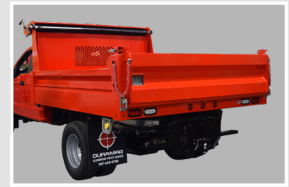
Powder Coating Color Options