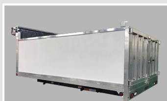
Double Wall (Graphics) Upgrade