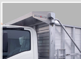
Electric Tarp Option