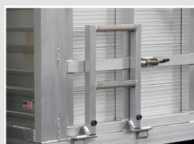
Fold-Up 2 Step Ladder