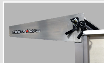
Cab Shields: 12", 24", 36", 42"