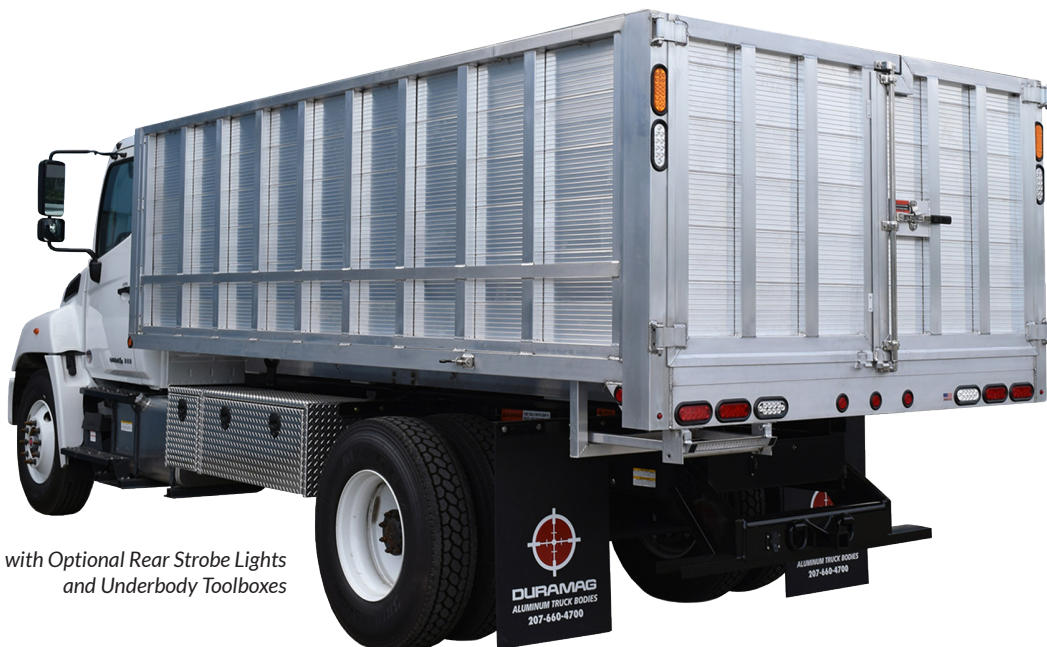
Shown with Optional Rear Strobe Lights and Underbody Toolboxes