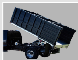
Powder Coating Color Options