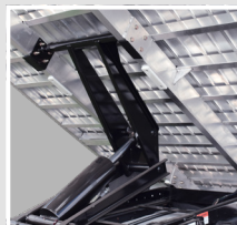
Champion Hoist Installed