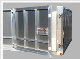
52" Side Door