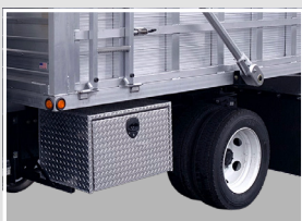
Under Body Tool Box (Diamond Plate or Smooth)