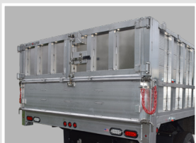
Two Way Dumping Tailgate