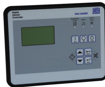
DGC-2020 DIGITAL CONTROLLER