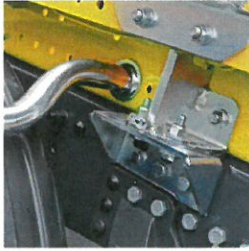
Subframe support brackets