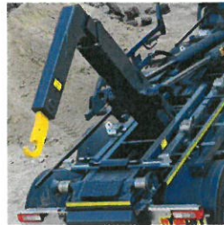
Corrosion resistant paint