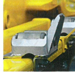
Zinc-plated container support