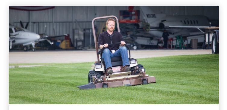
Featured Model 623T with 52-inch DuraMax® deck

* 1.25" is reached with the combination of raising deck forks to top position AND moving tractor mounts lower by one set of holes. 5.0" height is reached using High Mow Kit #503289 for 52" deck.