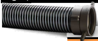
FIREQUIP MAXIFLEX PERFORMANCE AND WEIGHT CHART

Light, Flexible PVC Hard Suction Hose For Drafting