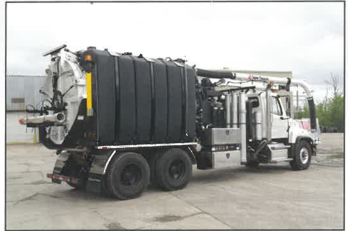
Camel 1200 / 12 Yard Debris Body