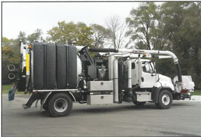
Camel 900 / 9 Yard Debris Body