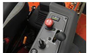
LED fuel gauge

* Warranty period is limited to whichever limit comes first, years of operation or hours of operation. See participating Husqvarna servicing dealer for details.