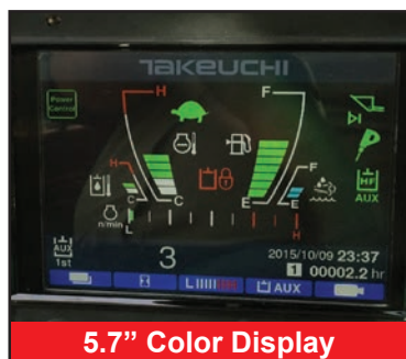
5.7" Color Display