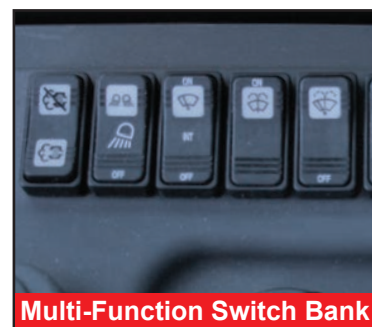
Multi-Function Switch Bank