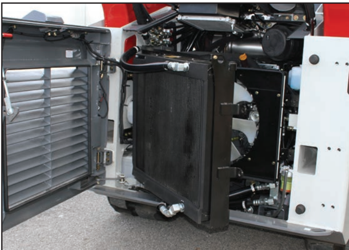
Convenient Service and Maintenance Access