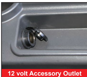
12 volt Accessory Outlet