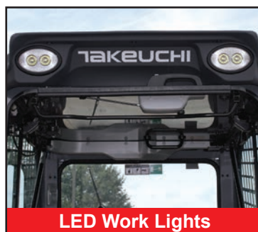
LED Work Lights