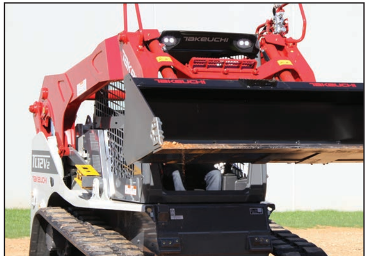
Vertical Lift Path for Balance and Stability