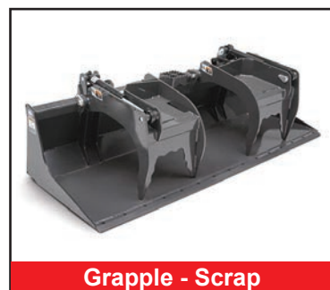
Grapple - Scrap

Takeuchi now offers attachments for all of your Takeuchi equipment. See your authorized Takeuchi dealer for additional information and attachment options.