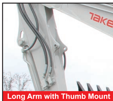
Long Arm with Thumb Mount