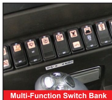
Multi-Function Switch Bank