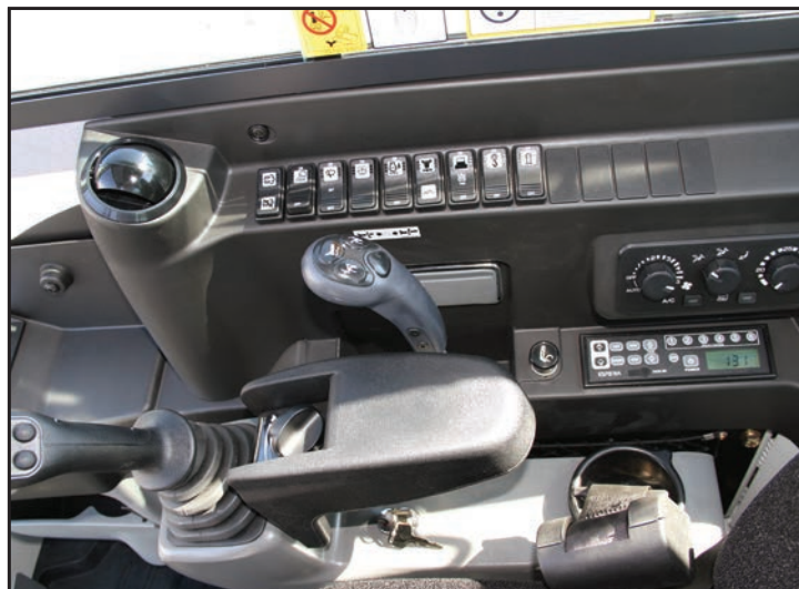
Automotive Styled Interior