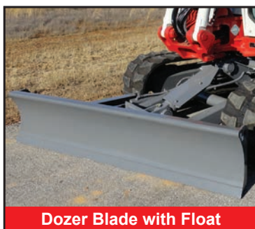
Dozer Blade with Float