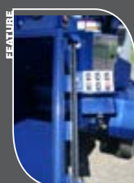
Two Control Panels with Emergency Stop