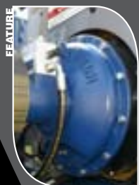
HPTO Wet Clutch