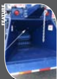
Patented Automated Feed Sensor