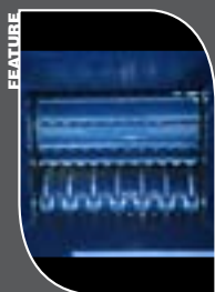
15" Hydraulic Feed Roller