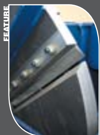
2" Thick Chipping Disc