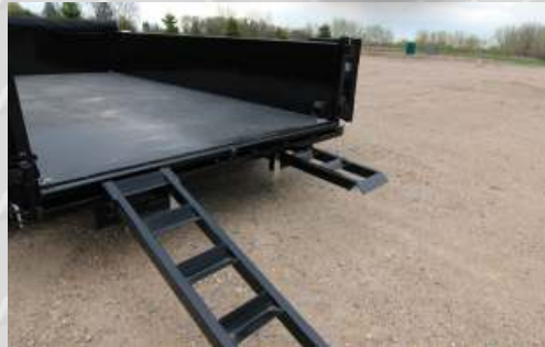
Ladder-style ramps for loading equipment, stored under dump body.