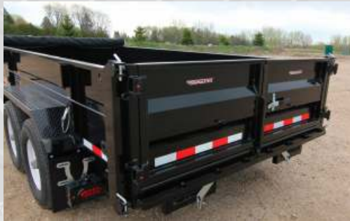
Three-way double-doors open to the side, down, or swings open from the bottom.