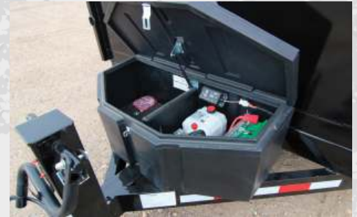
Poly storage box houses hydraulic system with room for chains, straps or tools.