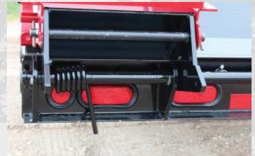
One-way spring-assist ramps and grommet mounted LED lights.