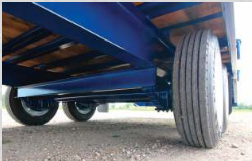
Single-wheel tandem axle. 8K axles with spring-ride suspension.

This economical trailer is great for mid-sized equipment. Built on the Towmaster® I-beam frame, this trailer features 3-inch I-beam crossmembers, 8'-6" wide deck, 5-foot angle-iron beavertail and 5-foot one-way spring assist ramps. The TC-16 is a single-wheel twin axle trailer. Sealed wiring and grommet mounted LED lights are standard.