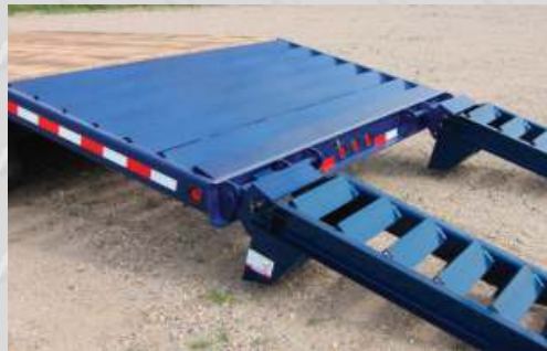
Angle-iron beavertail and ramps provide excellent traction for loading and unloading.