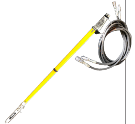
Hydraulic Pole Saw