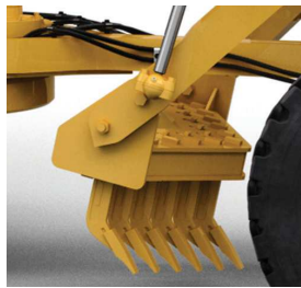
MID MOUNT SCARIFIER