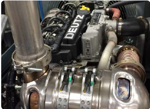
DEUTZ DOC, Diesel Oxidation Catalyst; allows for maintenance free operation