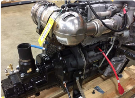
108mm Air End, designed and made in Michigan City, IN