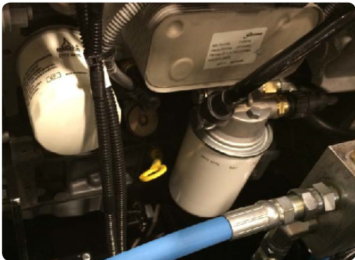
Easy Access fuel filter, oil filter and dipstick