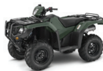
FourTrax Foreman Rubicon 4x4 Automatic DCT MSRP $8,699*