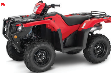
FourTrax Foreman Rubicon 4x4 EPS