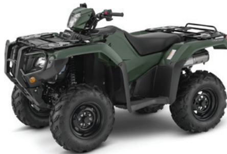
FourTrax Foreman Rubicon 4x4 Automatic DCT