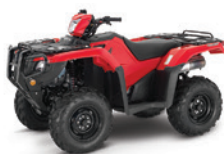
FourTrax Foreman Rubicon 4x4 EPS MSRP $8,799*