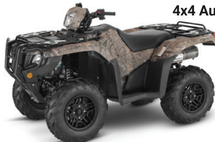
FourTrax Foreman Rubicon 4x4 Automatic DCT EPS Deluxe