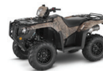
FourTrax Foreman Rubicon 4x4 Automatic DCT EPS Deluxe MSRP $9,899*