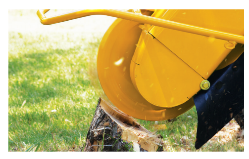
YELLOW JACKET™ CUTTER SYSTEM. The Vermeer-exclusive Yellow Jacket cutter system is designed to provide faster, easier serviceability, as well as extended pocket and tooth life.