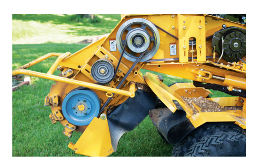
CONVENIENT BELT SERVICING. Belts on the SC362 are serviceable from one side of the machine with cutter drive belts being adjustable with movable idlers. Additionally, each belt set may be adjusted independently, without affecting adjustment of other belts.