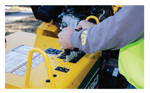
OPERATOR PRESENCE SYSTEM. Control handles for the boom swing, boom raise/lower and machine propel are equipped with an operator presence handle design which provides capacitancesensing capability. This user-friendly operator presence system is intended to help protect the operator and enhance operator safety.