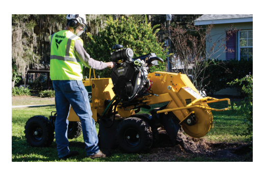
POWERFUL STUMP REMOVAL. A 35 hp (26.1 kW) Vanguard engine offers low vibration, low emissions, smooth easy starting, extended starter life and an instant return to maximum power. Also offers a limited three-year warranty from Vanguard.