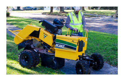
TWO-SPEED GROUND DRIVE. The operator may choose to operate in a high-range or low-range ground speed setting of 0-133 ft/min (0-40.5 m/min) to quickly move the machine or choose a slower speed when near the stump by utilizing a low-range setting of 0-66 ft/min (0-20.1 m/min).